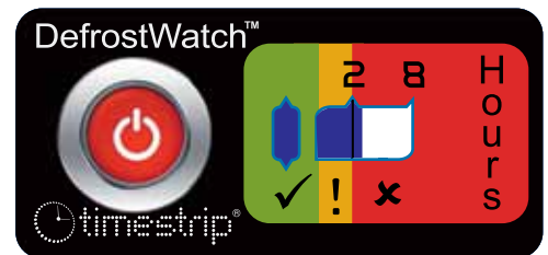
Breached Threshold temperature exceeded for more than 2 hours.

DefrostWatch’s major benefit is its ability to visually tell you if your freezer temperature has gone above safe levels for more than the recommended safe time.