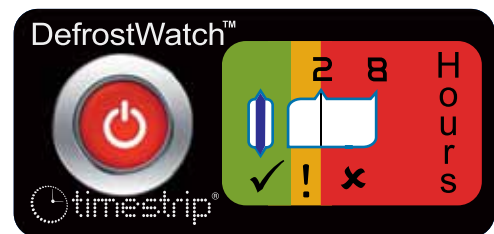
Activated Unit is active and ready for use. Threshold not yet exceeded