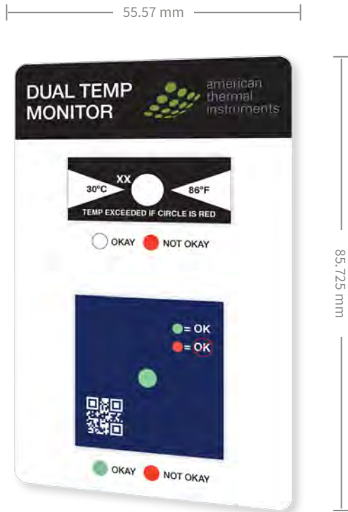
Activated state shown above